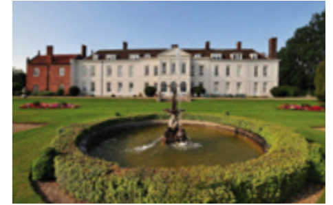
GOSFIELD HALL Essex