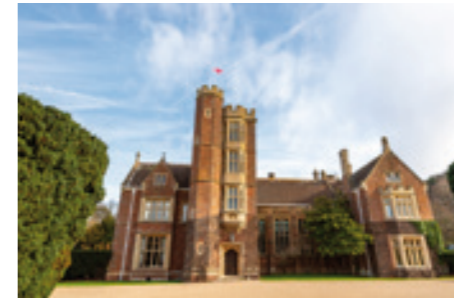
ST AUDRIES PARK Somerset