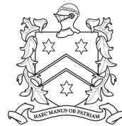
BOURTON HALL WARWICKSHIRE