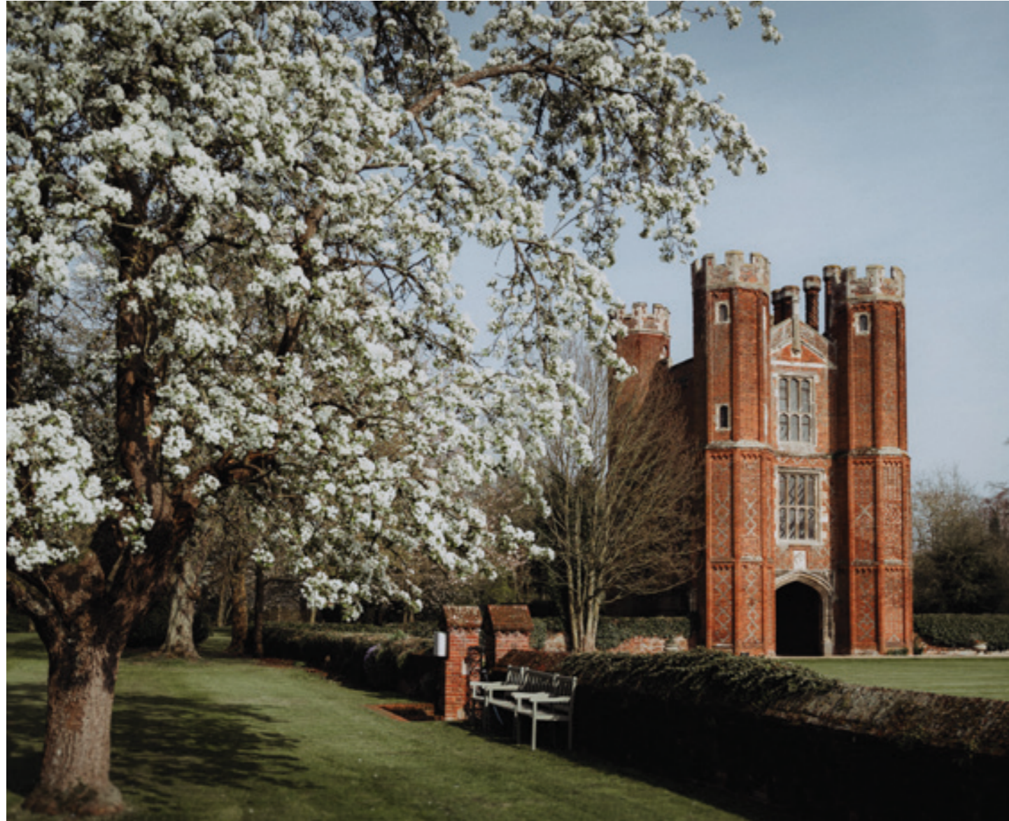
The spacious inner Courtyard, overlooked by the Great Tower, includes a croquet lawn and is the perfect sunny spot for drinks and canapé reception, with the outside bar available in the summer.