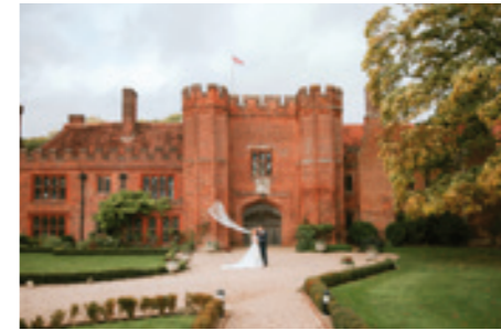
LEEZ PRIORY Essex