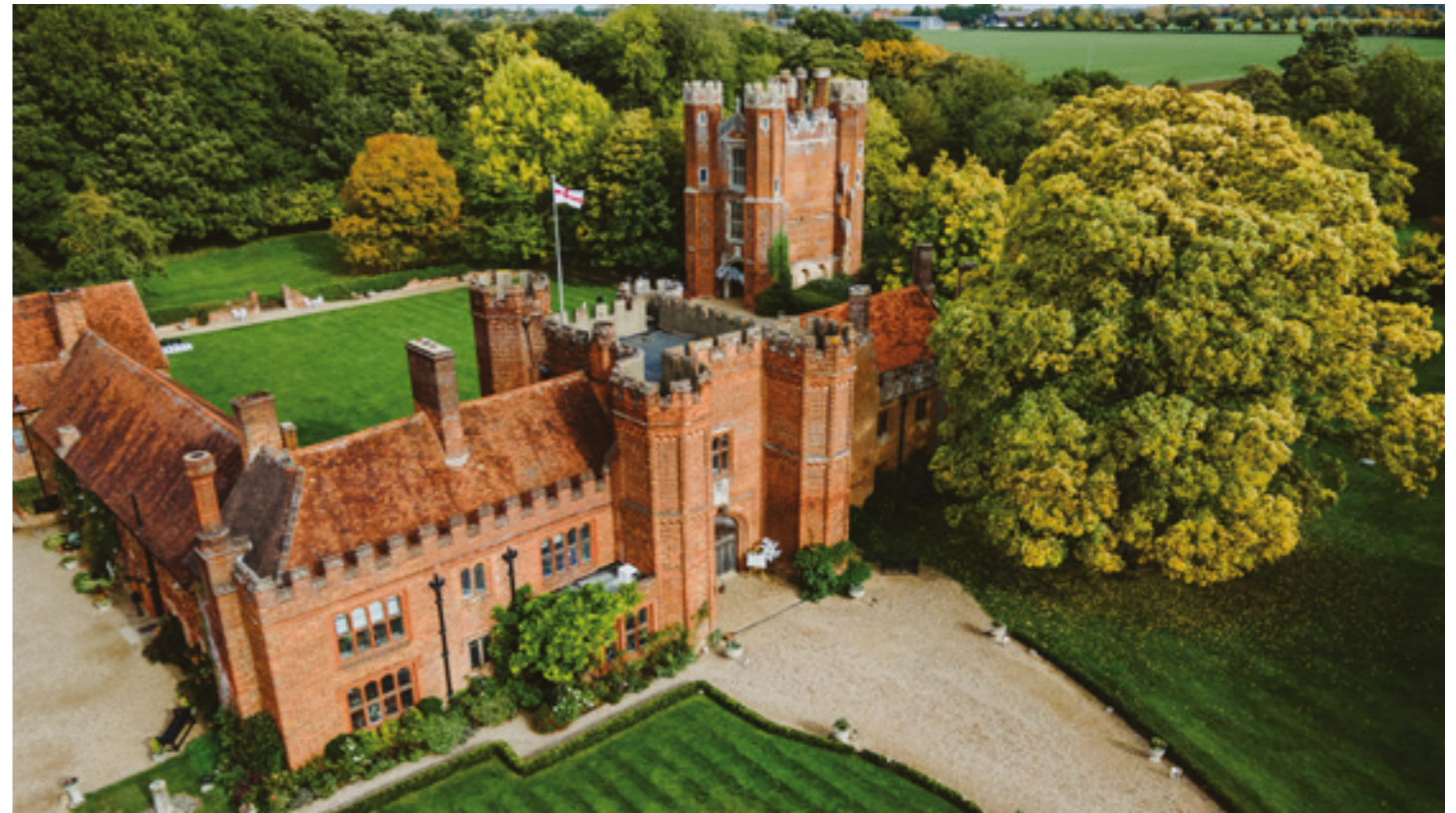
This superior Tudor manor house is set within 40 acres of ancient parkland, lakes and gardens, yet is just 15 minutes from Chelmsford and the M11, putting it within easy reach of guests travelling from outside of Essex.