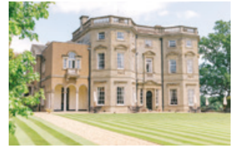
BOURTON HALL Warwickshire