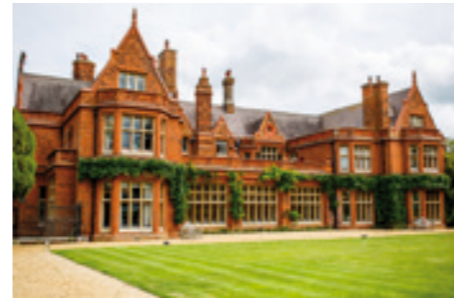
HOLMEWOOD HALL Cambridgeshire

Each venue is used purely to hold one wedding per day allowing our couples to enjoy a real tailor-made wedding experience. Our venues each have their own full-time team of staff and managers that are highly trained and dedicated entirely to delivering dream weddings for our couples.