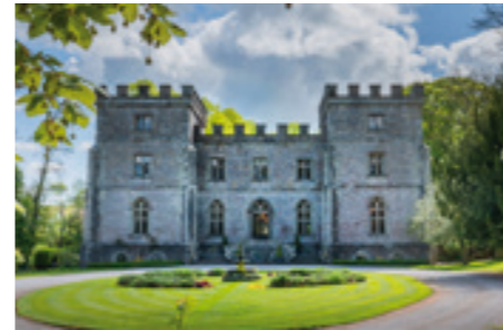
CLEARWELL CASTLE Gloucestershire